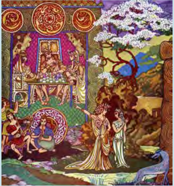
BOOK ILLUSTRATION BY MICHEÁL MAC LIAMMÓIR, IRISH THEATRE ÁRCHÍVE, DUBLIN CITY LIBRARY AND ARCHIVE

Email cityarchives@dublincity.ie for details.